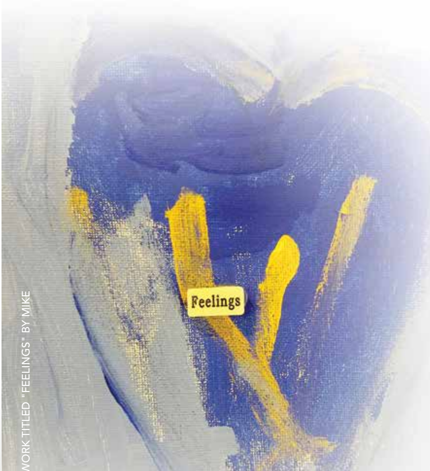
ARTWORK TITLED "FEELINGS" BY MIKE

The Implementation Team is also developing strategies to ensure that all staff are applying PBS principles on a day-to-day basis and to ensure that they have the tools needed to support our participants so that they can meet their goals.